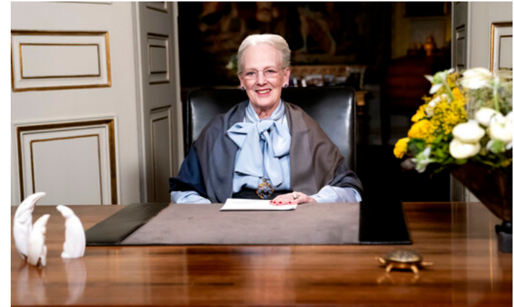
The Queen's New Year's address.