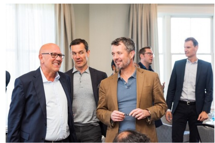
The Crown Prince at the DenmarkBridge CEO Summit in San Francisco in the USA.