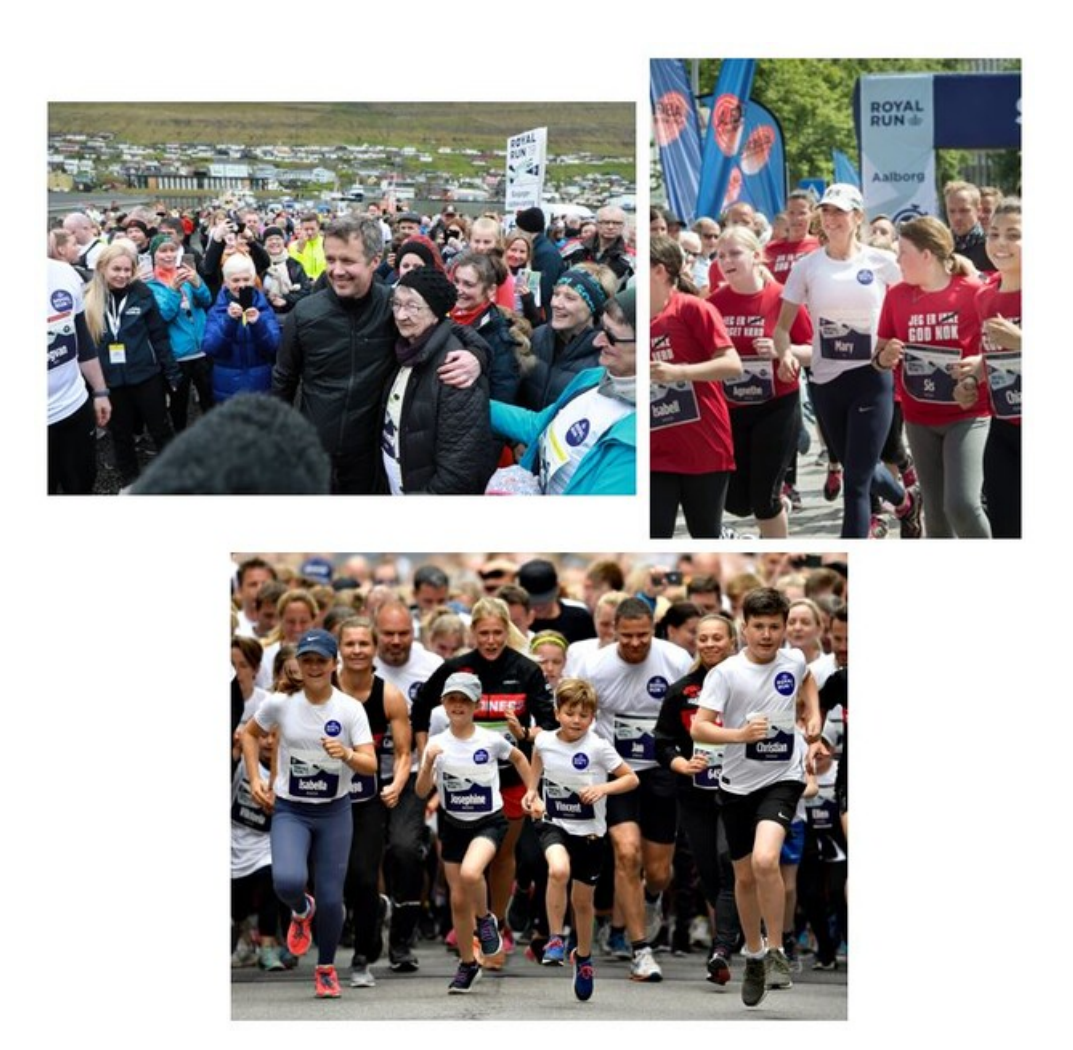
The Crown Prince Family took part in Royal Run 2019 in Aalborg, Aarhus, Copenhagen/Frederiksberg and on the Faroe Islands with more than 82,000 registered participants in all. On Bornholm, Royal Run was held without royal participation.