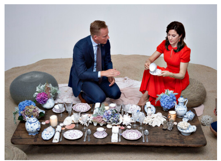
During the Crown Prince Couple's business promotional campaign in South Korea, The Crown Princess took part in the opening of a Royal Copenhagen exhibition at K.O.N.G. Gallery in Seoul.

Later in the year, on 25 November, Their Royal Highnesses participated in marking the 100th anniversary of the re-establishment of diplomatic ties between Denmark and Poland. In the capital, Warsaw, the Crown Prince Couple were welcomed at the Presidential Palace, after which Their Royal Highnesses opened a historians' conference about the 100 years of Danish-Polish relations, took part in a meeting focused on sustainable energy and met with Danish and Polish veterans, among other things.