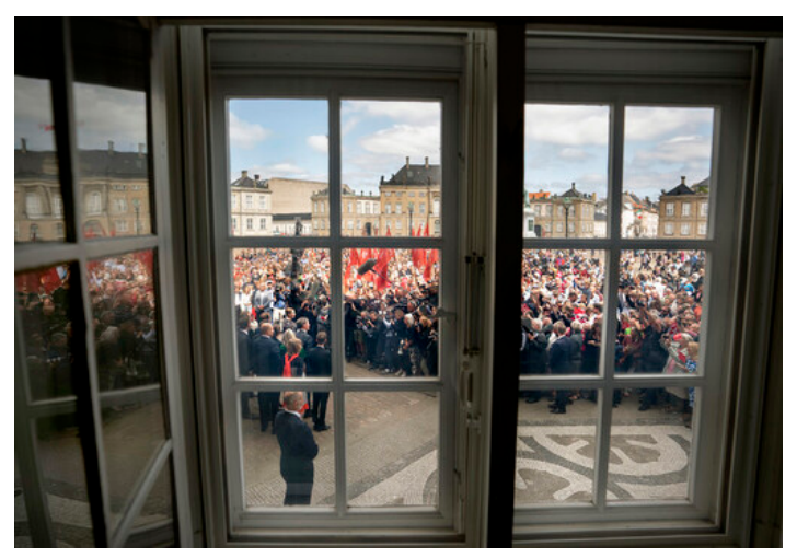
After being received, prime minister Mette Frederiksen presented the new government to the people gathered on the palace square.

During 2019, The Majesty also took part in a wide range of arrangements and events in the Danish Defence. The Queen's close relation to the three services - the Army, the Navy and the Air Force - follows a long tradition in the Royal Danish House.