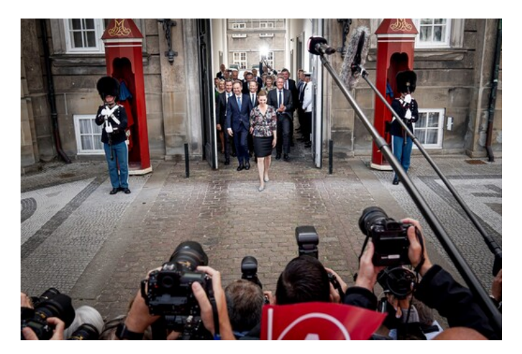
The Queen received Denmark's new government in Christian IX's Palace at Amalienborg.

The Queen and the prime minister have continuous close contact, including in connection with the Council of State, which is a state administrative body in which The Queen and The Crown Prince meet with the prime minister and all other members of the government. The Queen leads the Council of State meetings, in which the ministers, among other things, present adopted bills that must be ratified (signed) by The Queen before they can take effect. In 2019, The Queen presided over five councils of state.