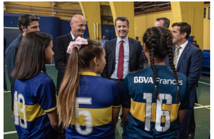
In the La Boca quarter of Buenos Aires, The Crown Prince visited the major club Boca Juniors and was introduced to the projects "Powerchair Football Argentina" and "Social Development Goals Football".

Argentina is increasingly asking for Danish technology and knowledge, and during the state visit The Queen and The Crown Prince led a Danish business delegation that focused on, among other things, equipment for agriculture and food production, sustainable energy, supplying and cleaning water as well as health care. Among other things, the state visit initiated close cooperation between authorities on water issues as well as a collaboration that will support integration of more wind energy into the Argentine energy system. Beyond the business promotion activities, The Queen and The Crown Prince also participated in a number of official arrangements and cultural events.