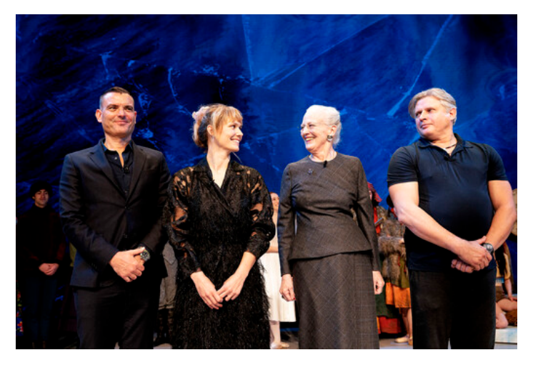
Together with the team behind the ballet production "The Snow Queen", The Queen took part in a press conference at Tivoli.

The Queen and Princess Benedikte participated in a commemorative church service and dedication of a new chasuble for Graasten Palace Church.