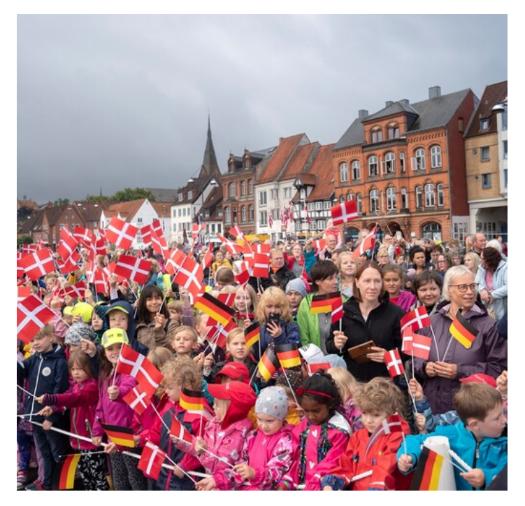
The Queen was on an official visit in the state of Schleswig-Holstein and visited the Danish minority.