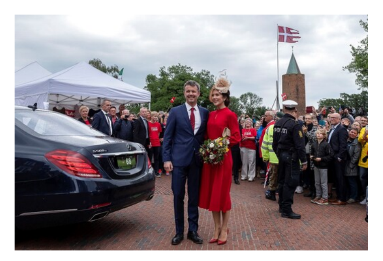
The Crown Prince Couple were present in Vordingborg, where Their Royal Highnesses witnessed the raising of a flag and visited the area where Valdemar the Victorious reigned around the time when Dannebrog fell from the sky.

around the time of the battle in Estonia. In Copenhagen, Their Royal Highnesses Prince Joachim and Princess Marie marked the day by participating in a commemorative church service at Copenhagen Cathedral, the Church of Our Lady, and afterwards at a community singing event at the City Hall Square.