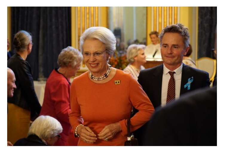
Princess Benedikte participated in the celebration of the 70th anniversary of SOS Children's Villages in Christian VIII's Palace at Amalienborg.