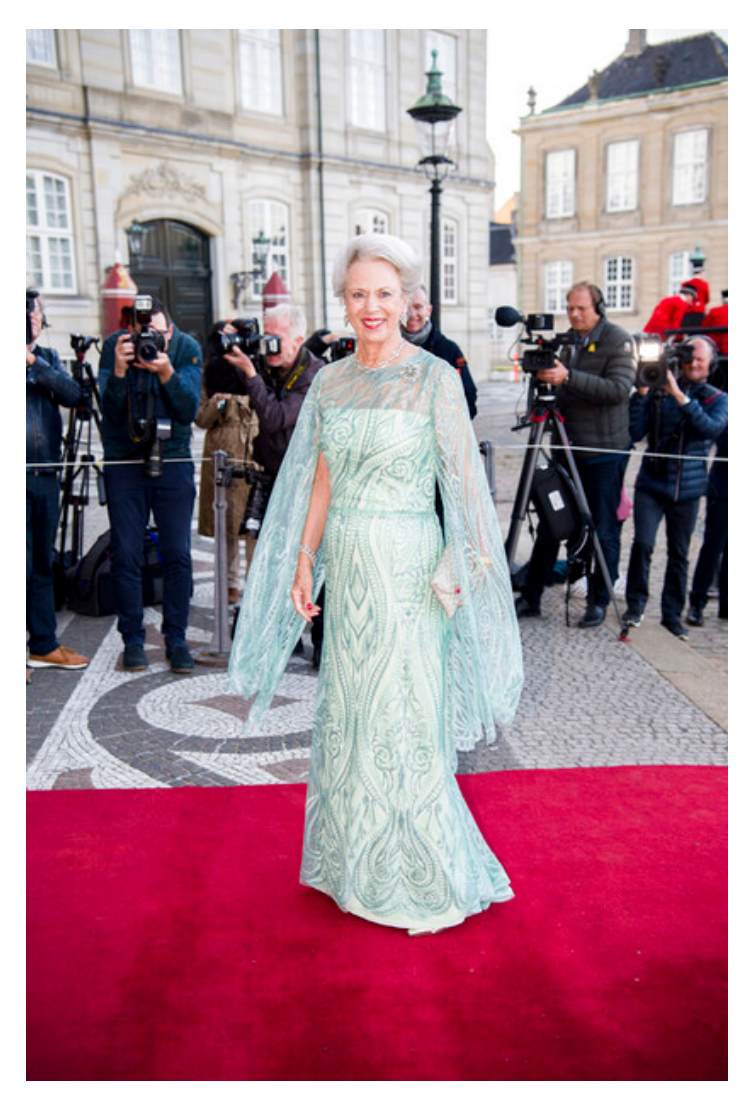
Princess Benedikte arriving for the banquet in Christian VII's Palace on the occasion of the Princess's 75th birthday.

Two days in 2019 were particularly festive in the Royal Danish House. On 29 April, Princess Benedikte celebrated her 75th birthday, and soon after, on 7 June, the Danish flag was once again raised across the country when Prince Joachim turned 50 years old. The round birthdays were individually celebrated with two banquets in Christian VII's Palace at Amalienborg, hosted by The Queen.