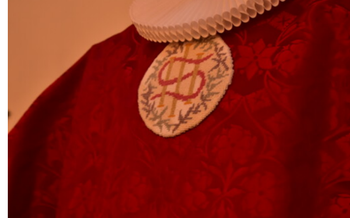
On the chasuble's front, The Queen has embroidered a Christogram. The monogram, which is based on the three first letters of the name "Jesus" in Greek, is surrounded by a crown of thorns. PHOTO: DEN DANSKE KIRKE I LONDON ©

The Queen has created a new chasuble for the Danish Church in London. On the back piece, an embroidered cross with the Luther Rose in the middle can be seen. The winding vines in the chasuble's pattern suggest the Gothic lines in the church. PHOTO: DEN DANSKE KIRKE I LONDON ©