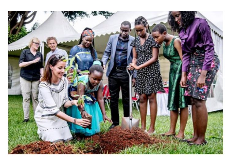
During the trip to Uganda, Princess Marie and five climate advocates planted two mango trees, which the Princess had received as a gift the previous day, in northeastern Uganda.