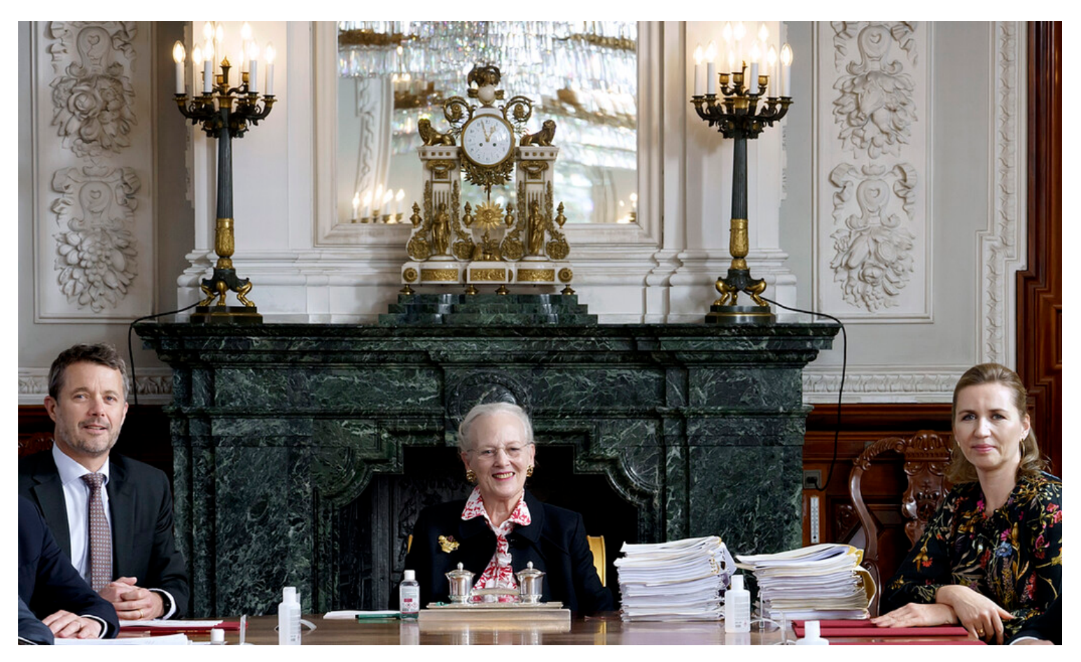
In October, The Queen, The Crown Prince and prime minister Mette Frederiksen participated in a council of state, which, as an exception, was moved to the Dining Hall at Christiansborg Palace.

In 2020, the holding of the councils of state was obviously affected by the Covid-19 situation and by the measures the pandemic outbreak had rendered necessary. This means that, during the year, only three councils of state were held, in February, June and October respectively, and that the councils of state in June and October were carried out in a different way in order to ensure the necessary distancing and reduce the total of people present.