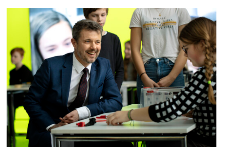
In connection with the official opening of HCØ2020 at the House of Industry in Copenhagen, The Crown Prince visited a number of exhibitions and greeted the school students.