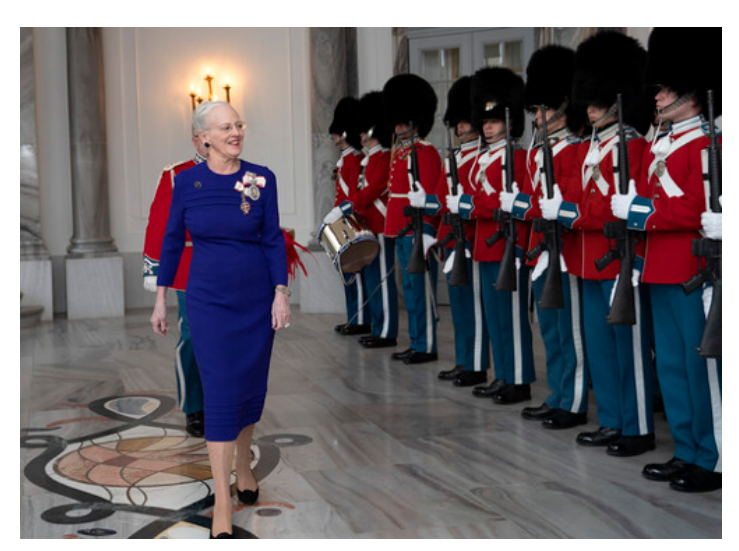
In connection with the reception of ambassadors in Christian VII's Palace at Amalienborg, The Queen inspected the Guard of Honor.

Before the lockdown of the country, approximately 1,000 guests began the year by wishing Her Majesty and the Crown Prince Couple a "Happy New Year" at the traditional New Year's levees at Amalienborg and at Christiansborg Palace.