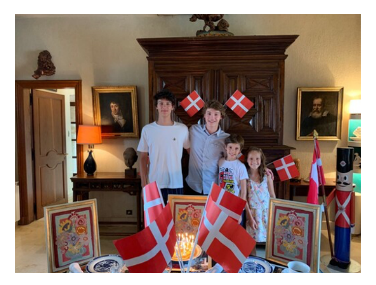
Prince Felix was celebrated at Château de Cayx in France when the Prince turned 18 years old in July.