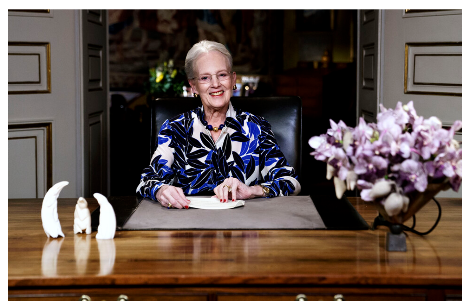
The Queen delivered her 49th New Year's Address from the reception room in Christian IX's Palace at Amalienborg.

In connection with the birthday, a number of expenses were paid, even though planned arrangements had been cancelled. That involved certain expenses for assistants, event spaces and catering that had been ordered and reserved and that the Royal Danish House chose to pay in whole or in part despite the cancellations. The celebration of the birthday was later presented via, among other means, digital media, which involved additional costs for IT software, equipment and time consumption.