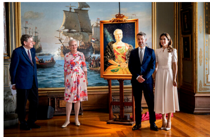
The Queen and the Crown Prince Couple participated in the opening of the exhibition "The Faces of The Queen" at the Museum of National History at Frederiksborg Palace and attended the unveiling of Niels Strøbæk's new portrait of Her Majesty.