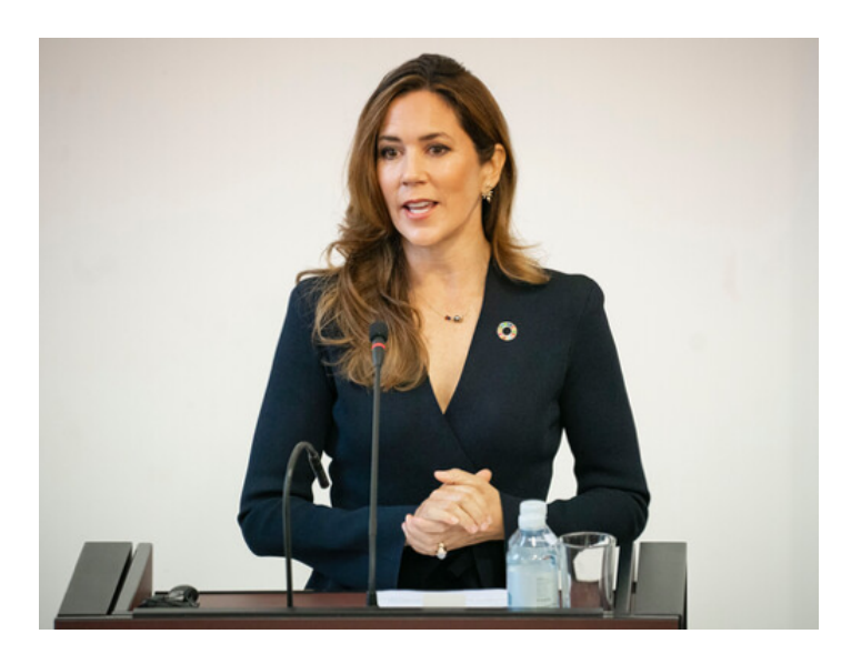
The Crown Princess spoke at the conference "A Decade of Action – 10 Years Left" in the Landsting Chamber at Christiansborg.