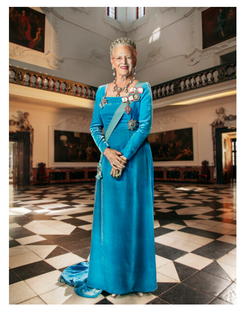
New official gala portrait of The Queen in the Dome Hall at Fredensborg Palace.