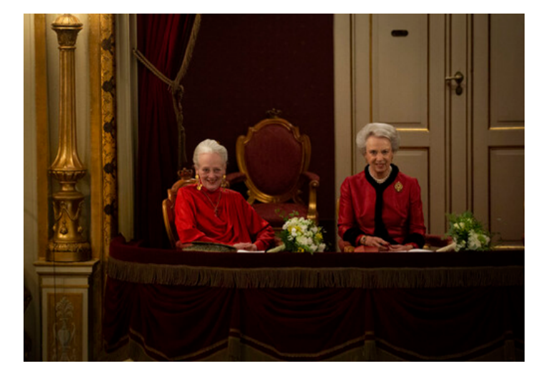
The Queen and Princess Benedikte attended a gala performance at the Royal Danish Theatre in connection with the centenary of the Reunification.

Queen attended a celebratory service at Copenhagen Cathedral, where bishop Peter Skov-Jakobsen's sermon focused on the importance of language and culture in the borderland.