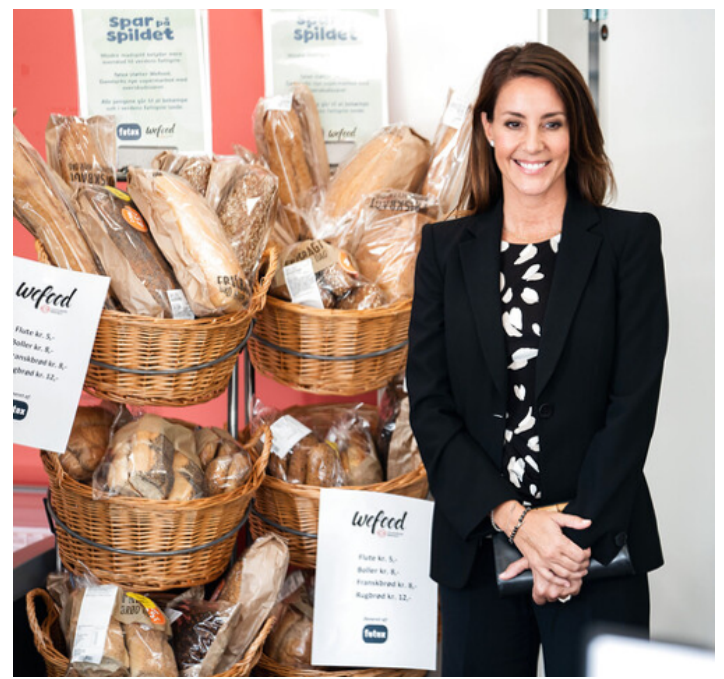
Princess Marie opened DanChurchAid's new Wefood shop in Tingbjerg in Copenhagen.

The fight against food waste was also in focus when the Princess both prepared food and gave a speech at the opening event in connection with the launching of Denmark's national food waste day on 29 September. At Axelborg in Copenhagen, the Princess was honored the same day with the award "Stræberen 2020" from the organization De Samvirkende Købmænd for her longtime efforts in the fight against food waste.