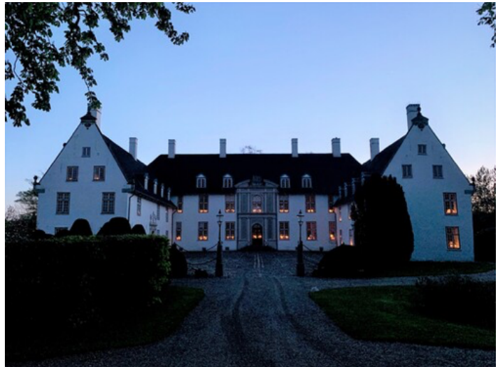
Prince Joachim and Princess Marie also marked the historic day with candles in the windows at Schackenborg Palace.