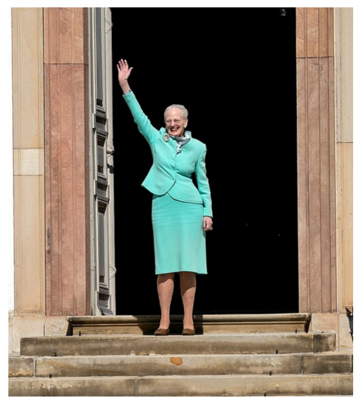
On the 80th birthday, after the community singing, The Queen appeared on the Front Steps at Fredensborg Palace and greeted those present.