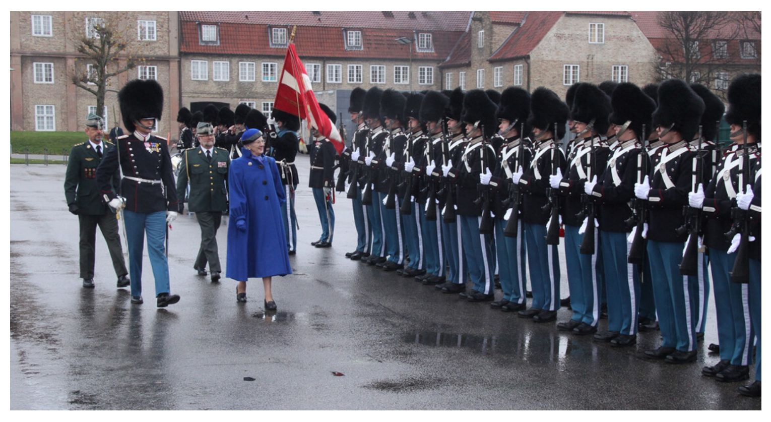
The Queen took part in the traditional Watch Parade and awarded "The Queen's Watch" at the Life Guard's Barracks in Copenhagen.