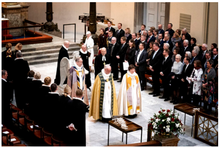
In Copenhagen Cathedral, The Queen attended a celebratory service in connection with the centenary of the Reunification.

In January, Princess Benedikte opened Museum Sønderjylland's exhibition "100 years with Denmark – Sønderjylland since The Reunification" at Sønderborg Castle, where Her Royal Highness emphasized the royal family's close connections with the region and its traditions in her speech.