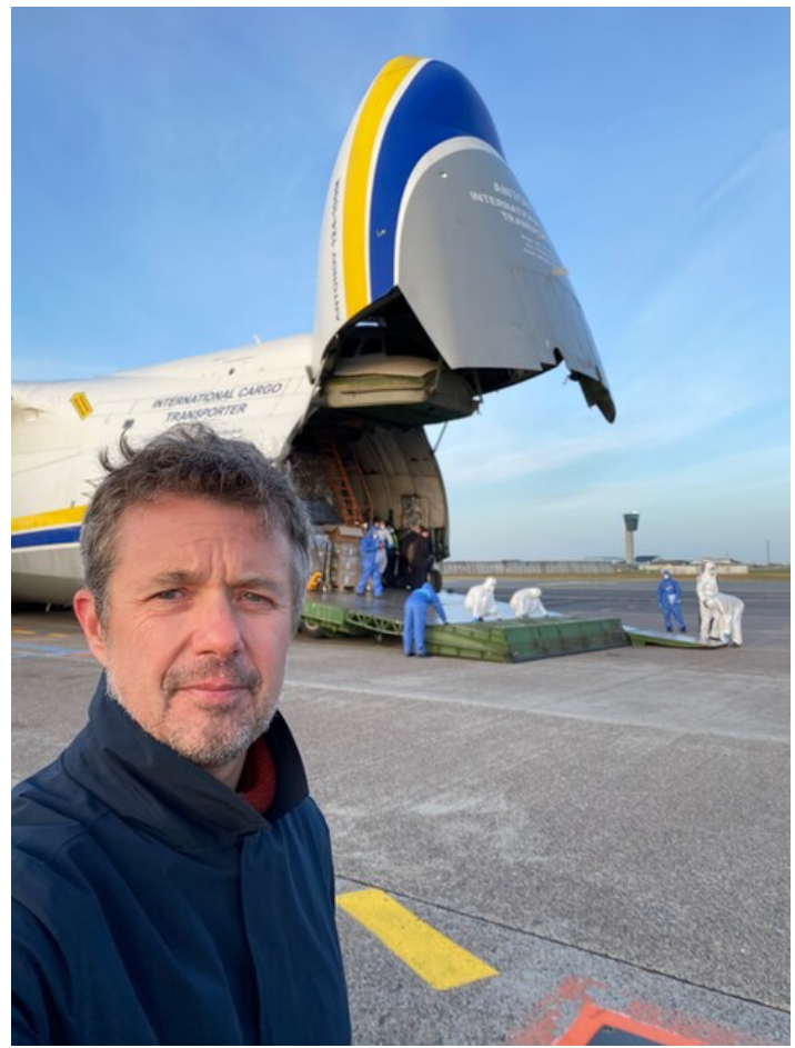
At Copenhagen Airport, The Crown Prince witnessed one of the world's largest cargo planes land with protective equipment from China for the Danish health care system.

During the year, Her Royal Highness The Crown Princess had special focus on the pandemic's consequences for the mental health of children and young people. On 1 May, The Crown Princess sent out a greeting via the DR singing program "Fællessang – hver for sig", in which Her Royal Highness spoke about the fear and worry that have affected many people and about the importance of talking openly about that, which is difficult. As patron of WHO's Regional Office for Europe, The Crown Princess on several occasions also emphasized the great efforts and significance of health care personnel in the fight against the pandemic – in Denmark, in Europe and around the world.