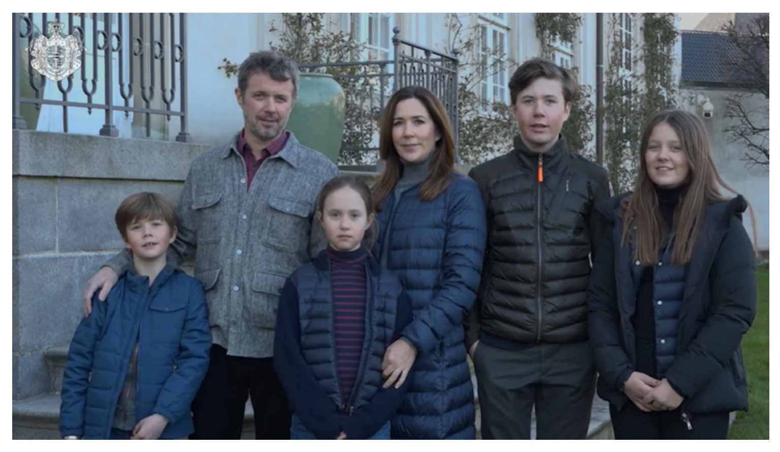
The Crown Prince Family sent a greeting to the Danish people in the TV 2 program "Danmark står sammen" from the garden behind Frederik VIII's Palace at Amalienborg.

On several occasions, His Royal Highness The Crown Prince expressed his pride over the Danish civil society's efforts to help fellow countrymen affected by coronavirus, for instance during a virtual visit to the Red Cross in March. Thousands of Danes had come forward as volunteers in the organization's help network and call center. Likewise, many Danish companies took on new tasks to alleviate the crisis, and, early one morning in April, The Crown Prince watched as one of the world's largest cargo planes, on initiative from Mærsk and the Capital Region, landed at Copenhagen Airport with protective equipment from China for the Danish health care system.