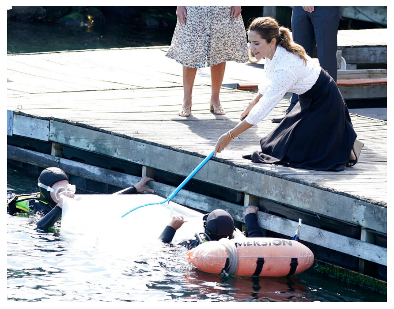
The Crown Princess was present at WWF Denmark's release of thornback rays from the Kattegatcenter in Grenaa.

The role as president of WWF Denmark is a natural extension of The Crown Princess's involvement in the work with disseminating and achieving the UN's sustainable development goals. On 9 September, Her Royal Highness gave a speech at the conference "A Decade of Action – 10 Years Left" in the Landsting Chamber at Christiansborg, where The Crown Princess put focus on the collective push needed to meet the 17 global goals by 2030.