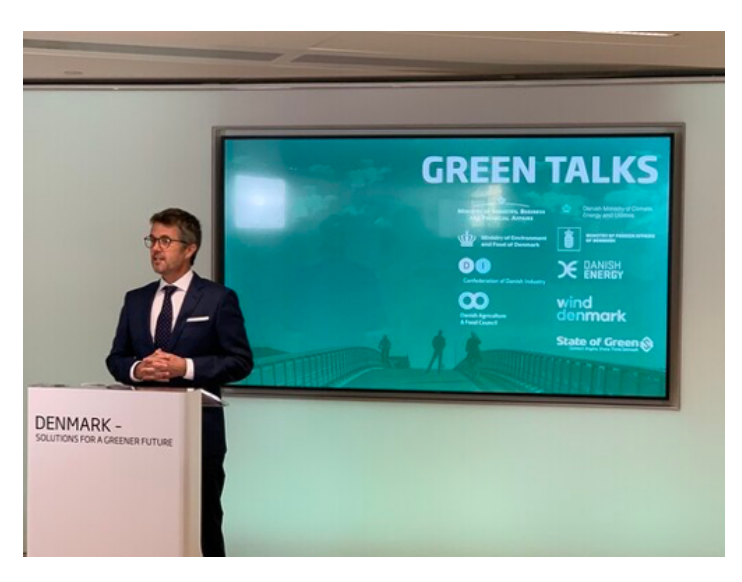
The Crown Prince gave a speech at the launch of "Green Talks", which took place at House of Green in Copenhagen. PHOTO: STATE OF GREEN \odot