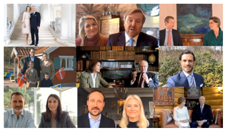
A number of Europe's royals surprised The Queen with a video greeting on the birthday.