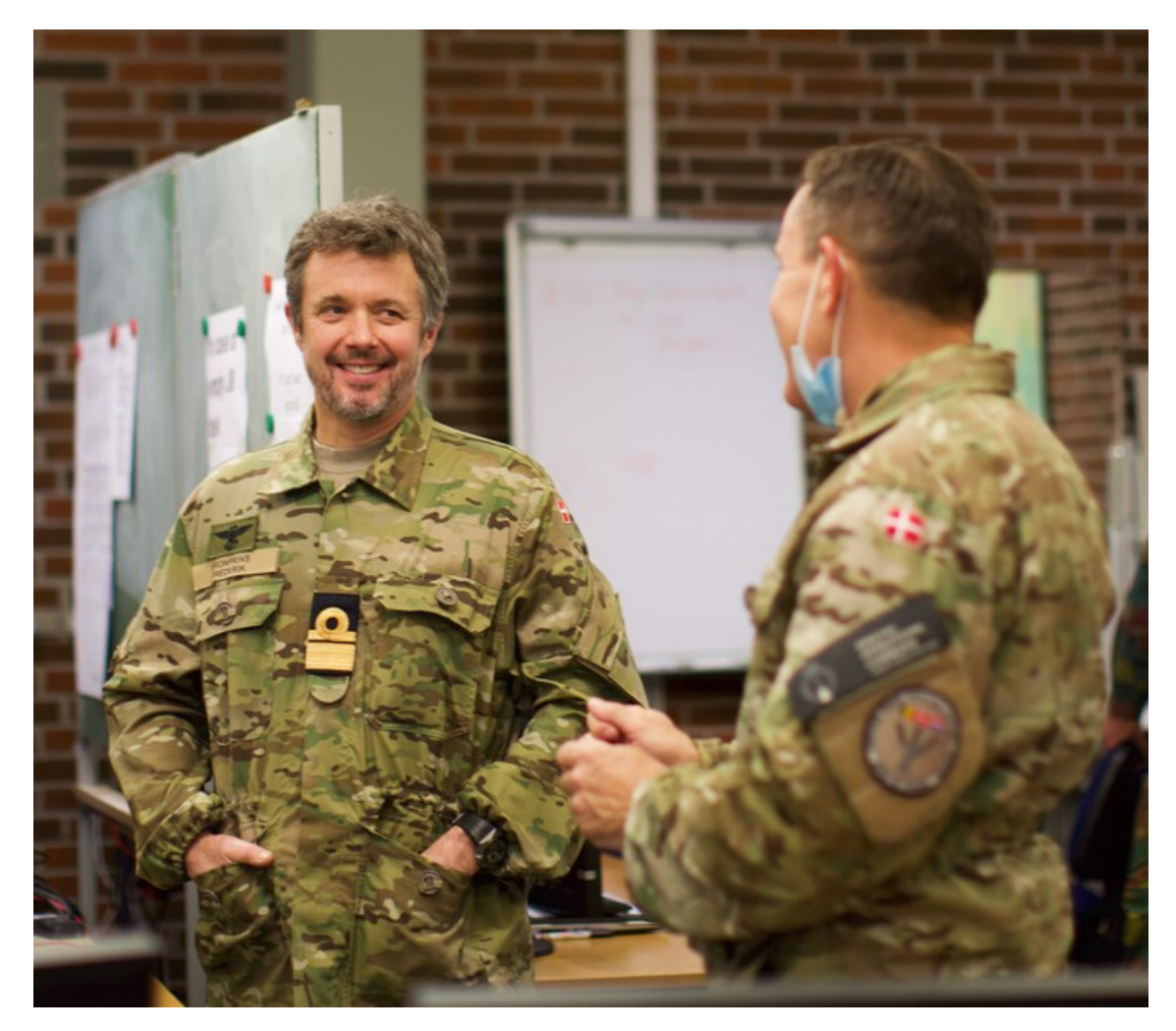
The Crown Prince visited the NATO exercise STEADFAST JUPITER-JACKAL 2020 at the Oksbøl Barracks.

Together, the Crown Prince Couple helped to honor the efforts made by Danes sent to the world's conflict areas when Their Royal Highnesses participated in the Flag Day for Denmark's military personnel and others officially sent abroad on 5 September. The Crown Prince Couple began the day honoring fallen soldiers by laying a wreath at the Monument to Denmark's International Efforts after 1948 at the Citadel in Copenhagen. Prime minister Mette Frederiksen and defence minister Trine Bramsen also took part in the ceremony, which was followed by a memorial service at the Church of Holmen in Copenhagen.