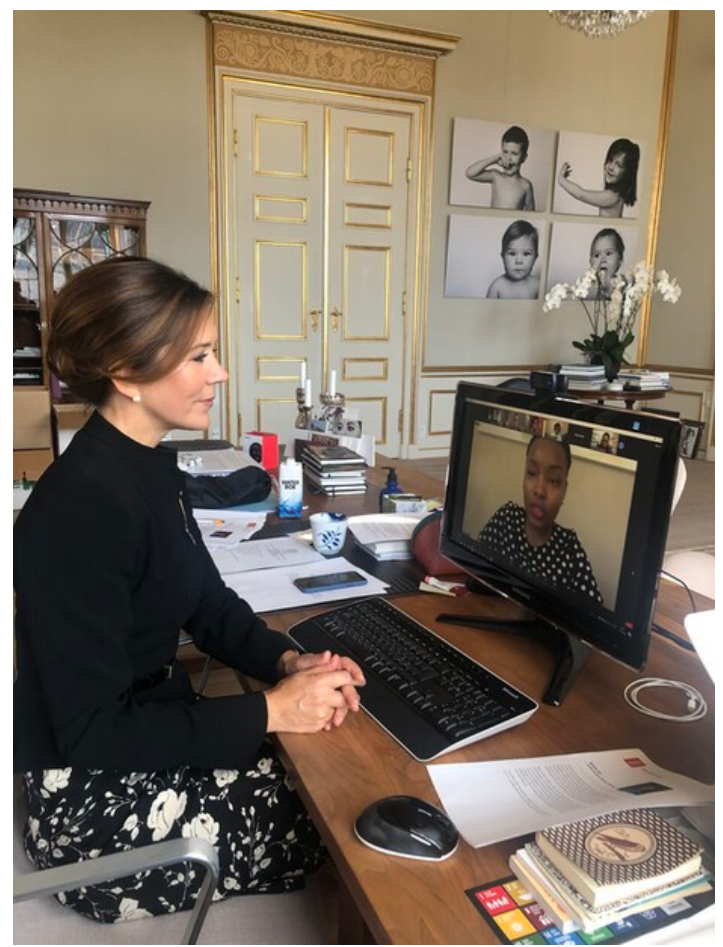
The Crown Princess took part in a virtual launch meeting in the ICPD25 High-Level Commission.

Through the years, The Crown Princess has been especially engaged in Global Goal 5 concerning gender equality, and, as patron of the UN's Population Fund, UNFPA, Her Royal Highness has taken an active part in the fund's work for girls' and women's reproductive health and rights through travels, projects and international engagements. In 2020, The Crown Princess agreed to join the fund's newly established, independent ICPD25 High-Level Commission, which will follow up on the commitments – including on women's access to contraception and to safe births – that were stated at the Nairobi Summit in 2019.