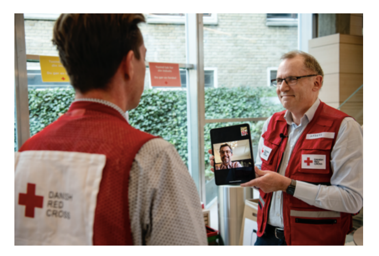
The Crown Prince participated in a virtual visit to the Red Cross and met volunteers in a call center and the organization's help network.