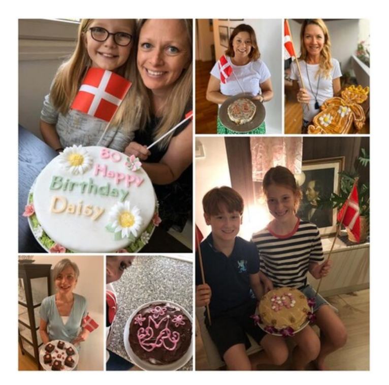
The Danish Women's Network in Thailand sent digital congratulations on the occasion of The Queen's 80th birthday.