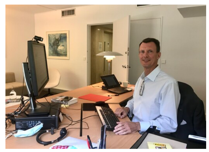
Prince Joachim began work as defence attaché at the Danish Embassy in Paris in September.