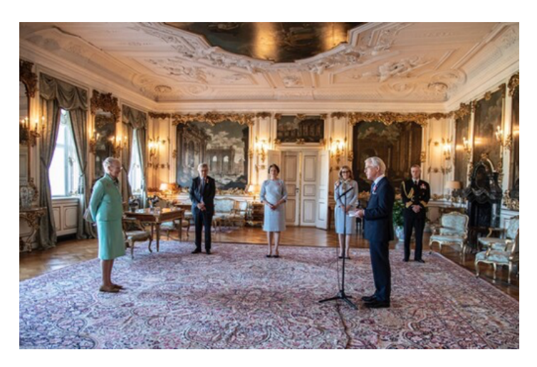
On the occasion of the birthday, the Lord Chamberlain delivered a speech to The Queen on behalf of the Ladies and Gentlemen of the Court in the Garden Room at Fredensborg Palace.