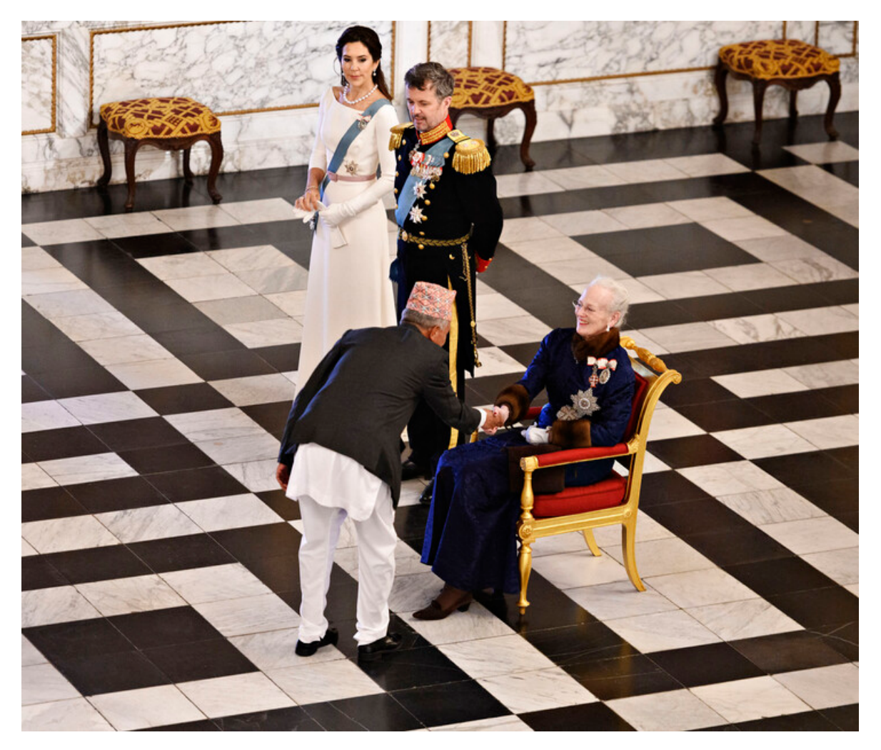
The Queen held a New Year's levee for the diplomatic corps at Christiansborg Palace in which the Crown Prince Couple participated.

In 2020, The Queen participated in a number of arrangements with the armed forces. In June and November, Her Majesty was able to thank the departing guards from the Royal Life Guard and award "The Queen's Watch" to the guards of the sentry company chosen as the service period's best at the end of the period. The traditional Watch Parade normally takes place at the Life Guard's Barracks in Copenhagen, but, in June, it was carried out for the first time at Marselisborg Palace, where Her Majesty also presented "The Queen's Watch" to the guard who should have received the award at the cancelled parade in March. At both parades, there were fewer spectators than usual. Marselisborg Palace was also the setting on 26 August when The Queen received new officers from the Royal Danish Navy.